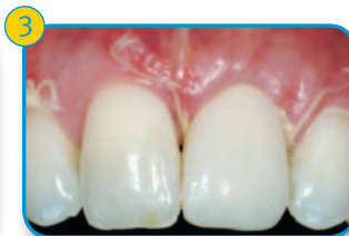
3 10-day post-operative. Note: excellent soft tissue integration.