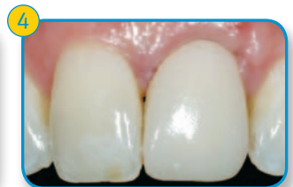
4 30-day post-operative. Note: aesthetic tissue blending and color.