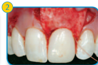
2 Puros Dermis Allograft Tissue Matrix surgically placed.