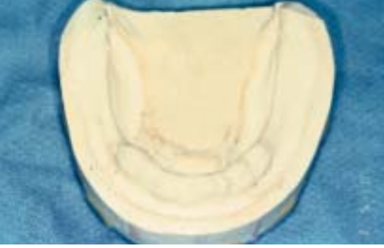
Figure 3—Stone cast demonstrates the severe bone resorption pattern in the mandible.

Since the patient's new denture would be used as the final restoration, an acrylic duplicate was made of it to function as a surgical