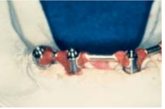
Figure 13—The bar pattern was formed by connecting the gold cylinders with gold bar segments.

from the time of placement, to two-piece rootand-crown analogs that were loaded after a brief healing period of no more than 6 weeks.<sup>21</sup> The long-term results of these early designs were highly variable and unpredictable because of a lack of appropriate biomaterials.<sup>22</sup> An immediately loaded porcelain-and-lead implant introduced in 1886, for example, remained in function for 27 years, despite the inherent toxicity of the metal.<sup>21</sup> The popularity of one-stage implants continued into the 20th century, with various designs introduced by Formiggini, Chercheve, Linkow, and others.<sup>23</sup>