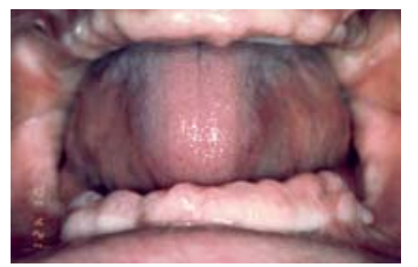
Figure 2—Clinical view of the patient's edentulous jaws.